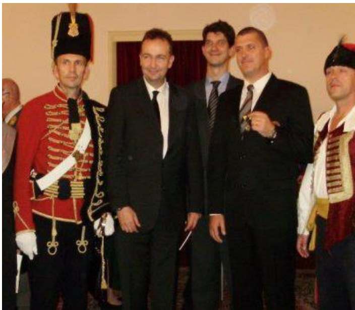
Karl von Habsburg, Heir to the Imperial and Royal thrones of the former Austro-Hungarian Empire, on a recent visit to Croatia, which was part of the old empire until late 1918.