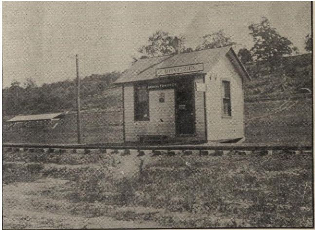
MONESSEN IN 1897

As we commemorate Monessen's one hundred and fifteenth anniversary in 2013, we look back to a description of Monessen and the founding East Side Land Company written in "Pittsburgh: the distributing point for the west and south; Allegheny County : destined to be the greatest manufacturing center of the world" in 1900.