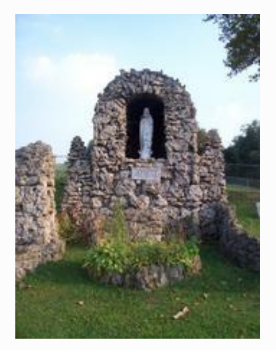
Giba Family Memorial in Most Holy Name of Jesus Cemetery, Monessen

Part of the building was used in later years as the office of the Magistrate.