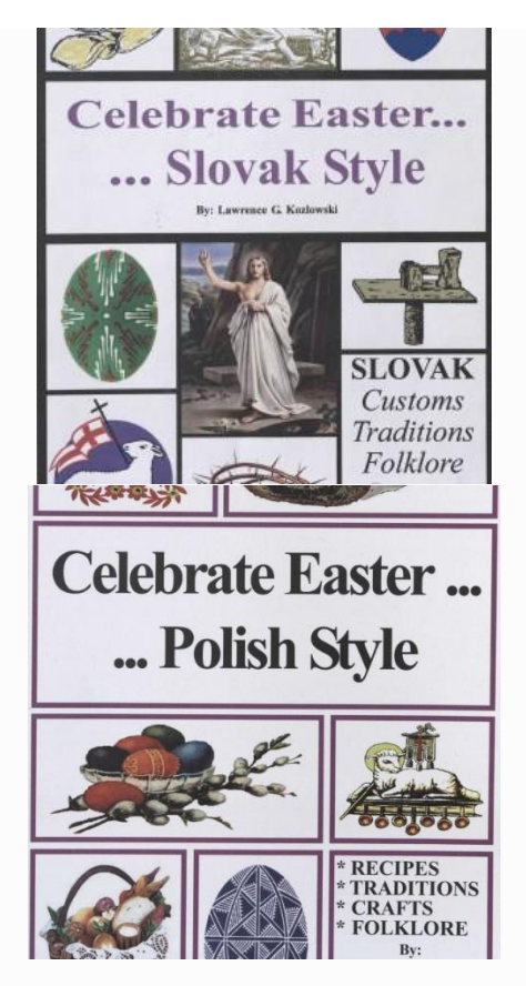
Celebrate Easter bks. $12 each