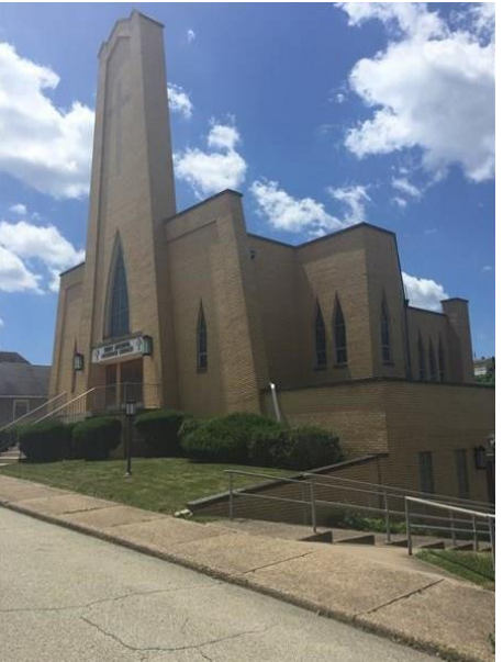
St. Michael Antiochian Orthodox Church. (Syrian)