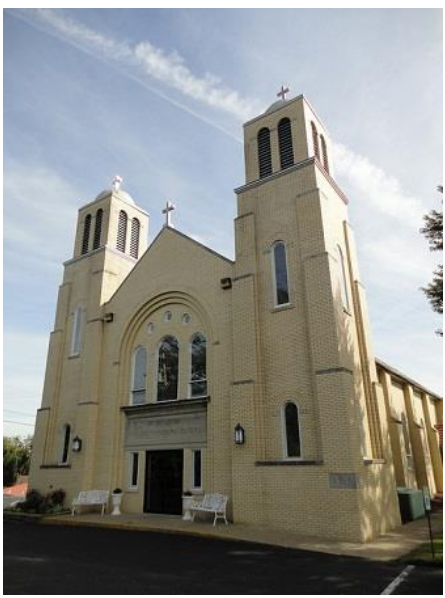
St. Spyridon Greek Orthodox Church