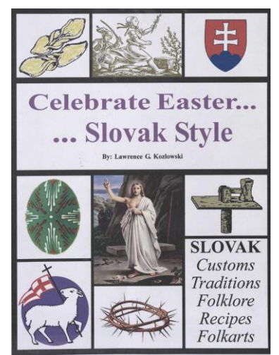
Available as Polish or Slovak: (Italian on order), $12.00

Easter Basket Covers or Table Scarves: $15.00 each