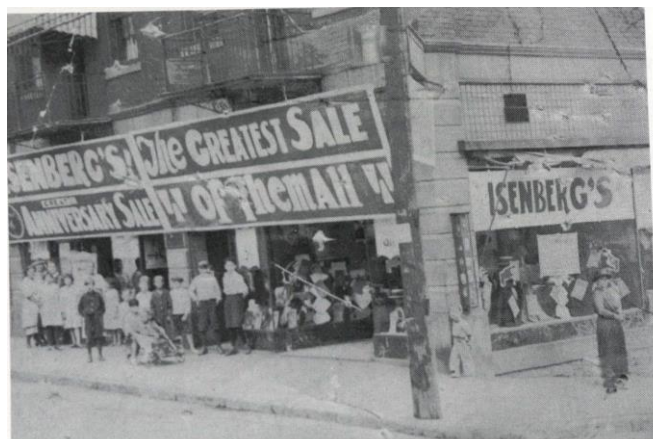
Eisenbergs, the corner of Fourth and Schoonmaker

Here are some photos from the Mon Valley Jewish Exhibit. We hope you will visit the displays in the Heritage Museum