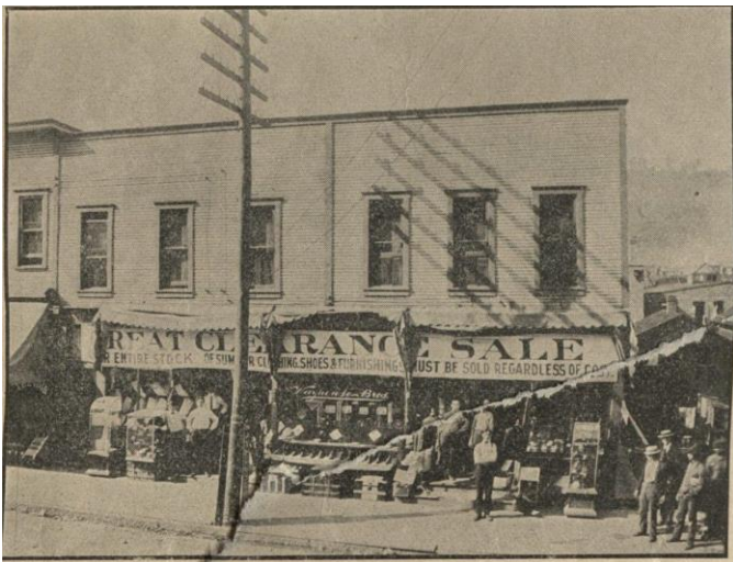
Nayhouse Brothers Store

With the coming of spring, the yearly membership renewal and fund campaign will be ending. We thank everyone who has paid their membership and donated a little extra to help operate the Heritage Museum. Thanks to your assistance in the past year, we were able to make great progress on the future home for the museum annex. The corner building looks great! But there is much work that needs done. The building needs an HVAC system, new wiring, plumbing, flooring, ceilings, walls, insulation, waterproofing, etc. We can only proceed with your help. The Historical Society is ALL OF YOU! Send in $500 and join the exclusive club of Museum Annex Boosters. Have your name remembered on a plaque with other donors. It is also important that all of you renew your membership each year, and if possible, make a contribution to either the Building Fund or the General Operating Fund. In these difficult times, every dollar counts. Please send your membership and donation today!