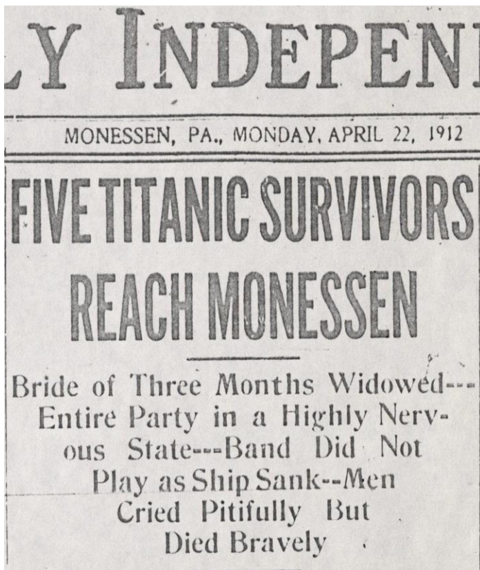
Remembering the Titanic and the local people who were on the ship – 100 years after the tragedy

We encourage you to dress in period-style clothing, either the elegance of First Class or the simplicity of the Third Class Steerage travelers.