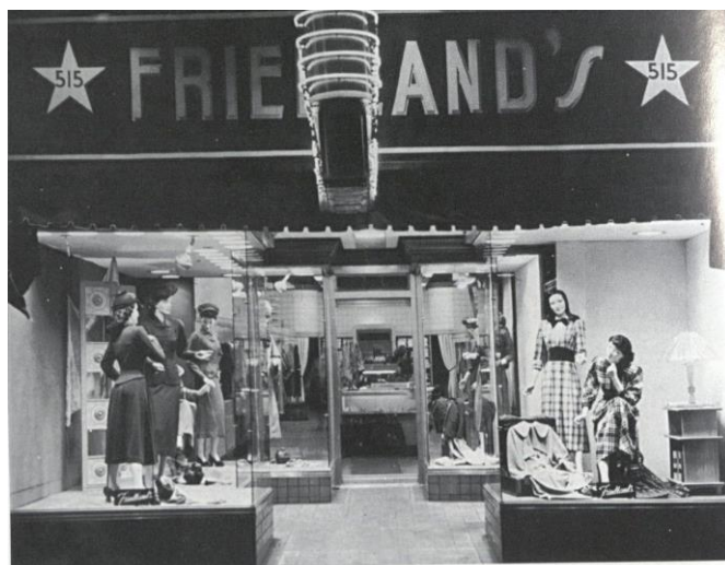
Friedlands Store, Donner Avenue