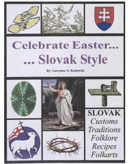
Slovak Easter Celebrations: $12.00