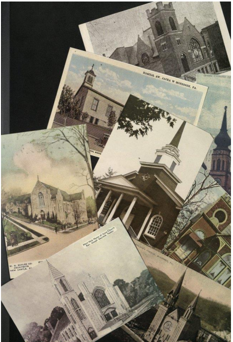
Reprint Postcards of Churches: $5.00 Pkg.

To order Easter items, visit our webpage: <u>www.monessenhistoricalsociety.com</u> or come to the Heritage Museum during regular business hours.