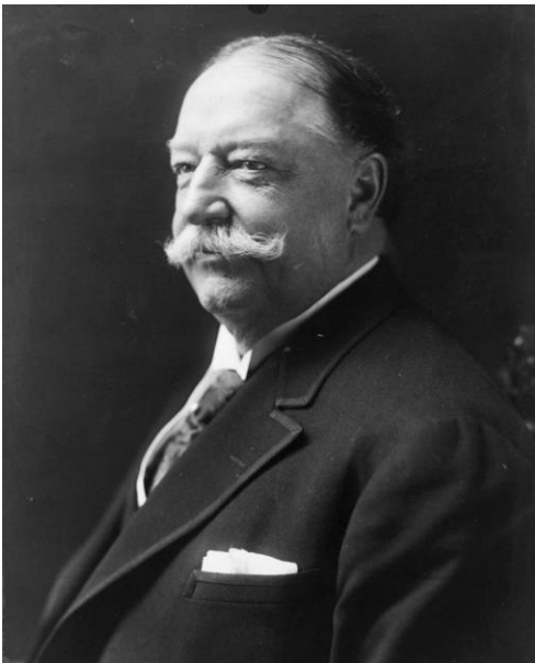
William Howard Taft