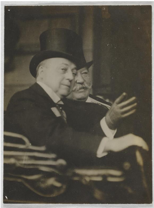
Monessen Founder Philander C. Knox with President William Howard Taft