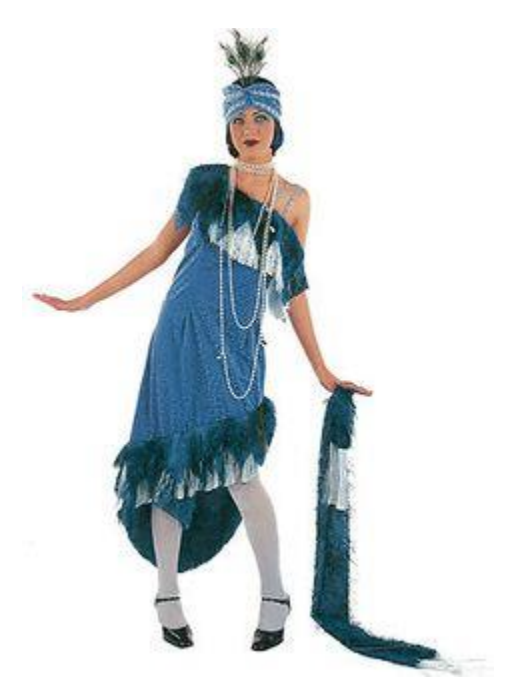
Roaring Twenties Dinner Saturday, September 17, 2016

To commemorate the ninety-fifth anniversary of Monessen changing from a borough to a city in 1921, the Historical Society will hold a Roaring Twenties fundraiser dinner on Saturday, September 17, 2016. The dinner will be held in Jozwiak Hall, in the St. Vincent DePaul Society building on Grand Boulevard. Tickets are $30 each. The meal will consist of dinner favorites popular in the Roaring Twenties. Come dance the Charleston! We encourage everyone to dress in period clothing reminiscent of the twenties. Only a limited amount of tickets will be sold! Stop at the Museum today!