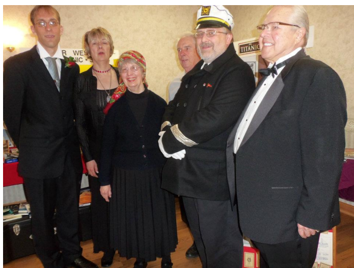
Greater Monessen Historical Society Board of Directors at the Titanic Experience