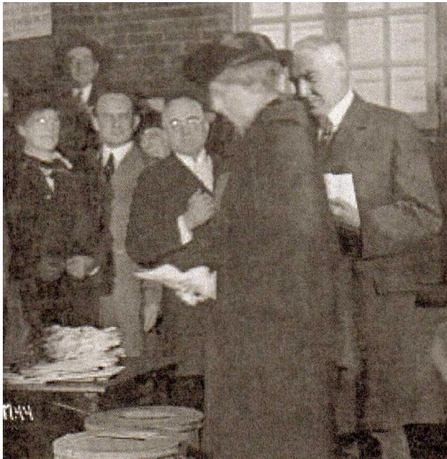
Mrs. Florence Harding casting her vote along with her husband, Senator Warren G. Harding in 1920 Presidential race