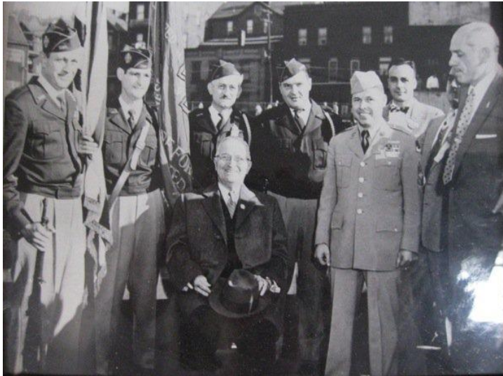
Monessen visit by former President Harry S. Truman.

We remind everyone that admission to the Heritage Museum is free. 😊