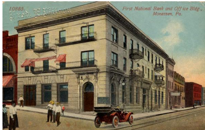
First National Bank – 6 th and Donner

Volunteers are always welcome! Come join our award-winning team!