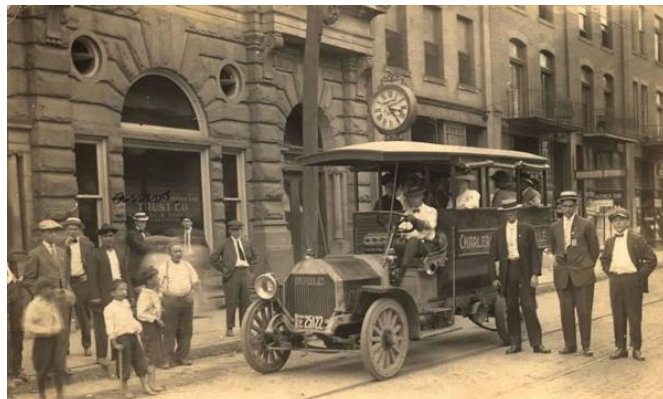
Monessen Savings and Trust Company – 5 th and Donner