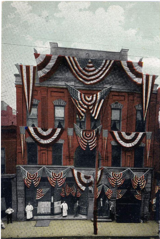
Grand Hotel, Monessen, Pa., July 4, 1910.