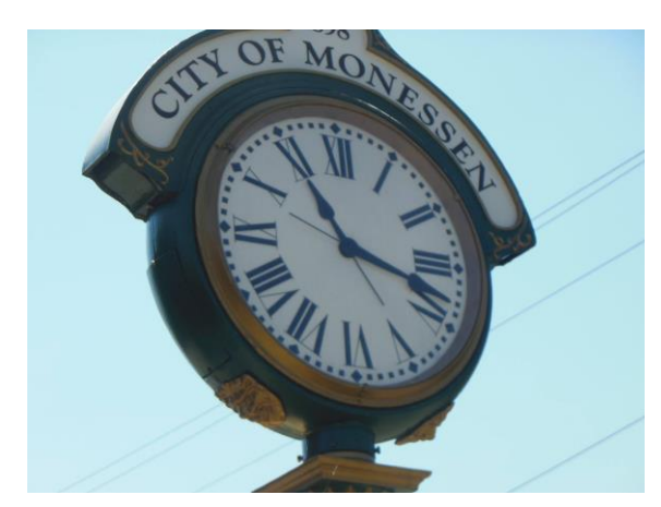
The Time Has Come! Help us Grow!