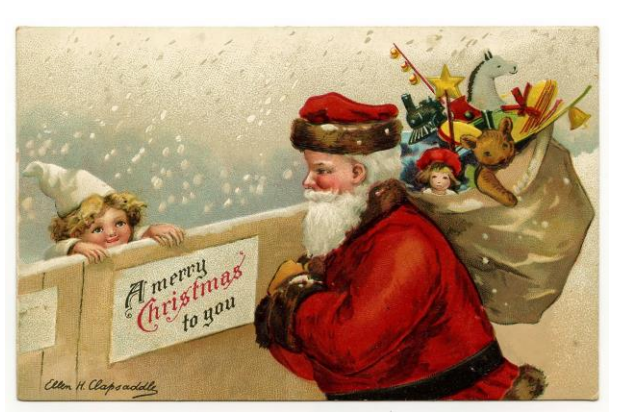
Monessen Community Christmas

Please donate old antique Christmas decorations to the Museum for use in our front show windows.