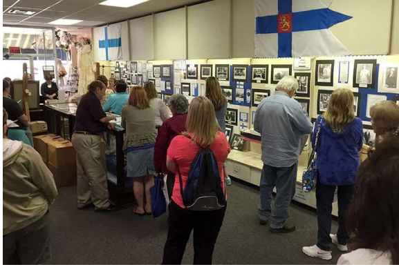
Professional cleaning of museum and carpeting.