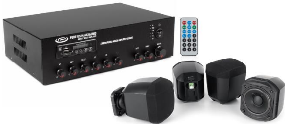
Replace Museum sound system for indoor and outdoor use