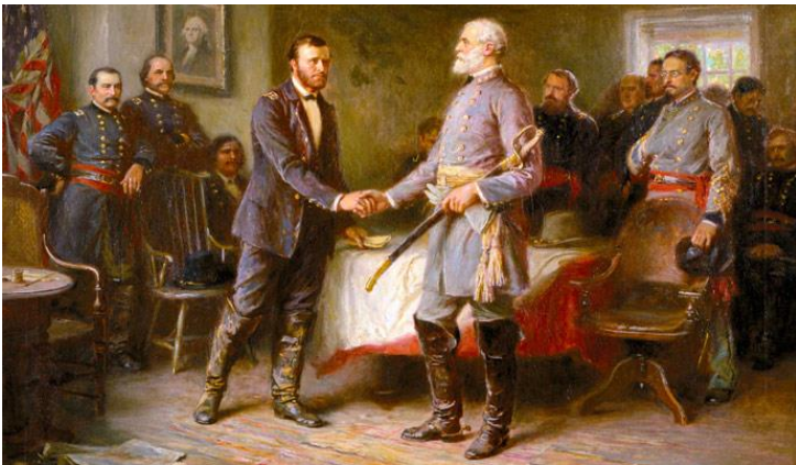
“Bells Across the Land: A Nation Remembers”

liner. As 2015 is also the twentieth anniversary of the Greater Monessen Historical Society, the dinner will serve a dual purpose of commemorating our anniversary. The event will be held at Jozwiak Hall in the St. Vincent DePaul Society Building on Grand Blvd, on Saturday, May 30, 2015, starting at 5 PM. Tickets are $25 each and feature a menu of dishes served on the Lusitania. The dinner consists of hors-d'oeuvres, roast beef, chicken, browned (roasted) potatoes, salad, dessert and beverage. We encourage everyone to wear their Edwardian finery, as we travel back in time to the early years of World War I. Tickets are available at the Heritage Museum by calling 724-684-8460. Reserve your ticket today, as only a limited number will be sold.