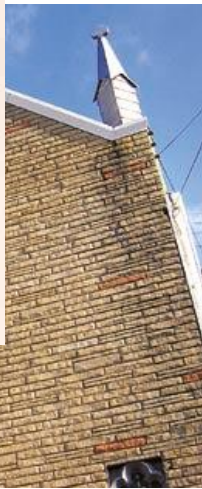
Former St. Luke's Finnish Church on Reed Ave.

Greater Pittsburgh Day Sesqui-Centennial Committee