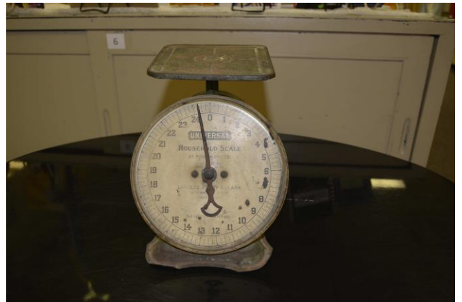
Dudas Maternity Hospital Baby Scale

In this edition of the newsletter, read all about a forgotten Monessen medical facility! See pg.7