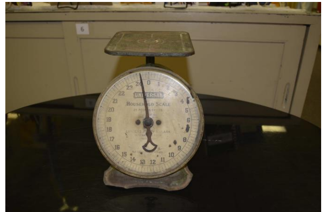
Dudas Maternity Hospital Baby Scale

In this edition of the newsletter, read all about a forgotten Monessen medical facility! See pg.7