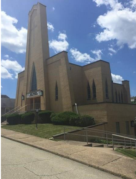
St. Michael Antiochian Orthodox Church. (Syrian)