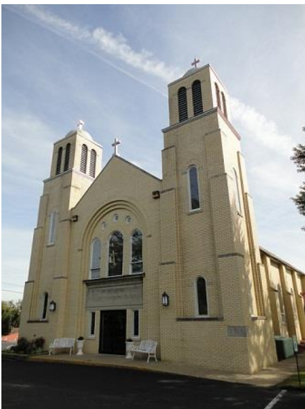
St. Spyridon Greek Orthodox Church