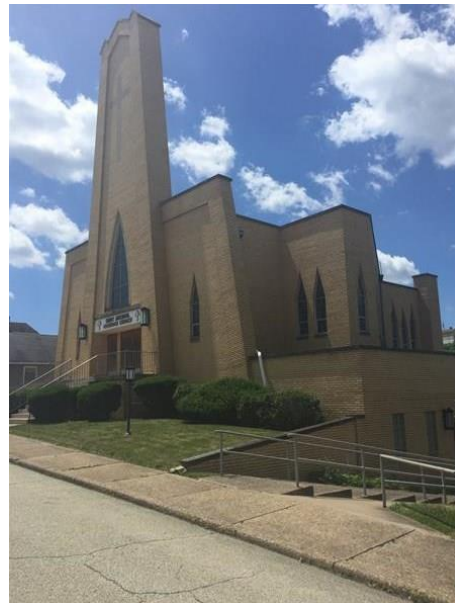
St. Michael Antiochian Orthodox Church. (Syrian)