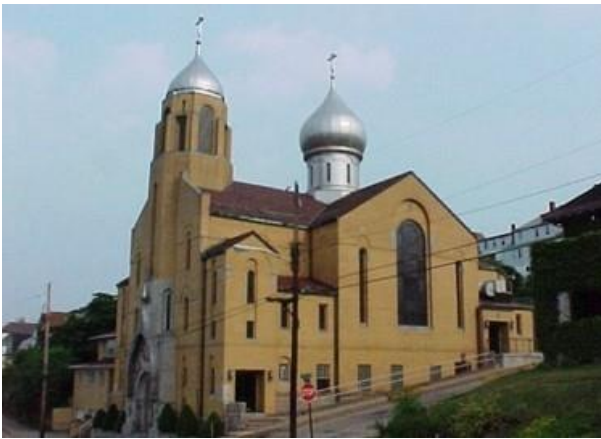
St. John the Divine Russian Orthodox Church. Originally called St. Cyril & Methodius.