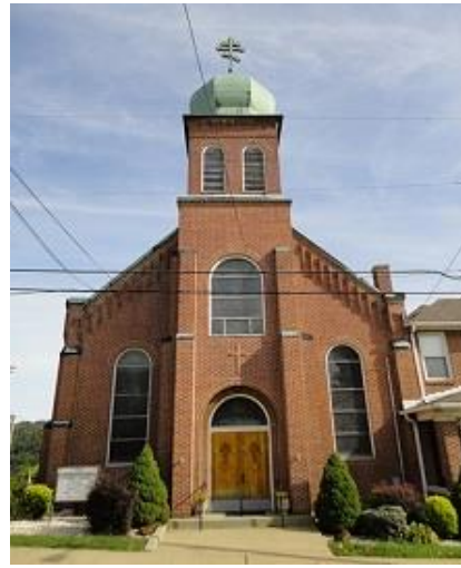
St. Nicholas Ukrainian Orthodox Church. Originally called St. Peter and Paul.