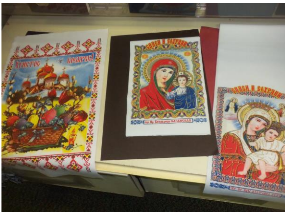
Easter Basket Covers or Table Scarves: $15.00 each

With Easter fast approaching, the Museum Shoppe has items that make great gifts.