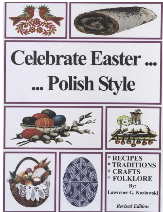
Polish Easter Celebrations: $12.00