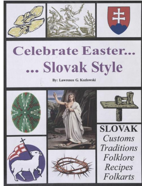
Slovak Easter Celebrations: $12.00