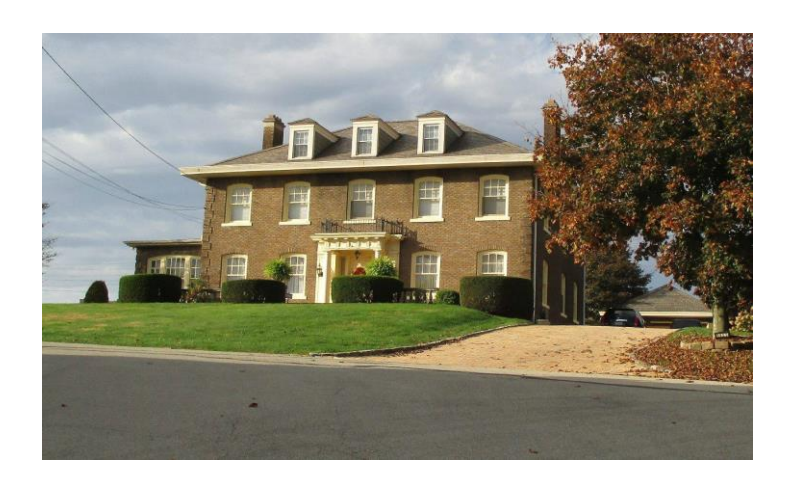
Historic Monessen Home for 2014 Chosen

The Greater Monessen Historical Society will have our annual Holiday Open House celebration on Saturday, December 20, 2014 starting at 12 noon until 3 PM. Drop by the Museum for some refreshments, goodies, cheerful music and fellowship. We hope to see you there.