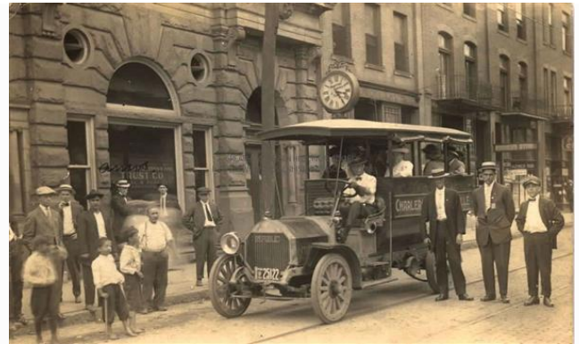
Monessen's original Brown Street Clock in front of the Monessen Savings and Trust Company at Fifth and Donner.